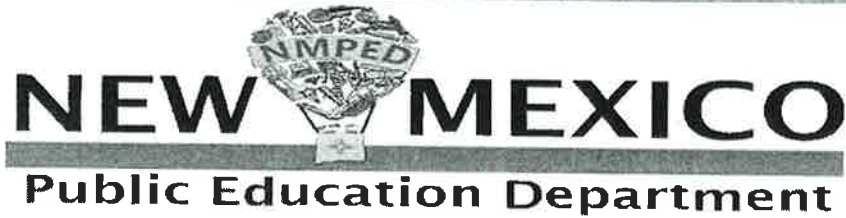
EXHIBIT A (27183 - New Mexico Grown FY23-24)

Award Name: New Mexico Grown Grant- Laws: 2023 HB/SB: SB-2, SB-4 Section: 5 Paragraph: 5 A-C