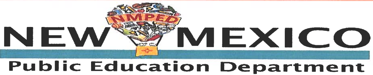
EXHIBIT A (27114 - FINAL FY22-23)