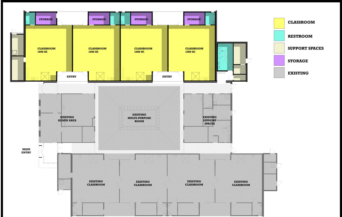
CHAPARRAL ON TRACK PRE-K FLOOR PLAN